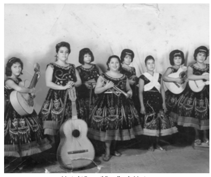
Mariachi Femenil Estrellas de Mexico

12 PERFORMANCES MAGAZINE PERFORMANCES MAGAZINE 13