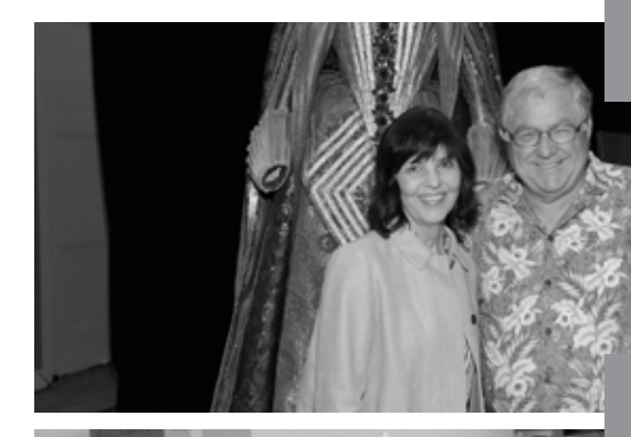
PRIVATE EVENTS WITH INSIGHTS FROM GLOBE CRAFTSPEOPLE

Join us today! Every gift makes an impact. Every gift makes theatre matter.