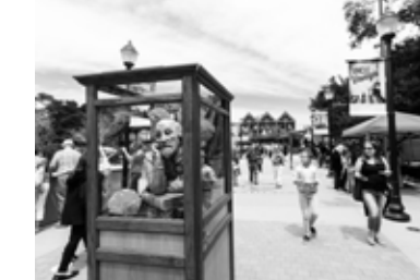
Happy Birthday, Mr. Shakespeare! AXIS event, 2018