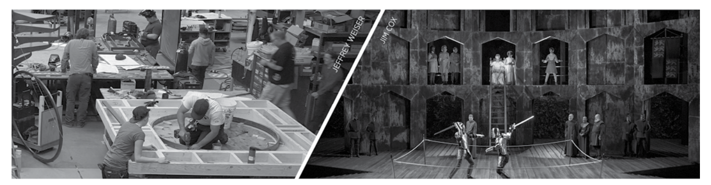
The Globe's Technical Center in Southeast San Diego buzzes with activity year-round as skilled craftspeople construct the incredible sets you see on our stages, such as in this summer's King Richard II .

$500 covers the cost of an actor's microphone so we can all hear those musical numbers and Shakespearean turns of phrase.