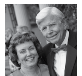
XOTTAH NHOL DNA *NYRHTAX