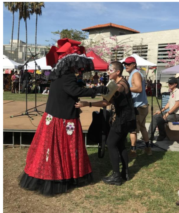
City Heights residents and Globe artists meet at the 2016 Day of the Dead Festival.

Summer coLABs are also planned with the Fourth District Seniors Resource Center, as part of their annual Juneteenth Celebration, and with Veterans Village of San Diego, to be presented at their annual Stand Down event serving homeless veterans.