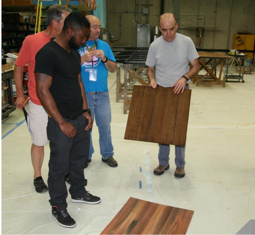
2016 Behind the Curtain class touring the Globe's Technical Center.