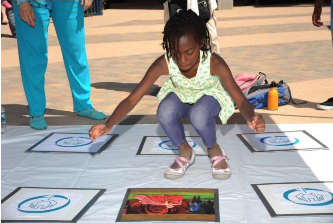
Happy Birthday, Mr. Shakespeare!, 2016.