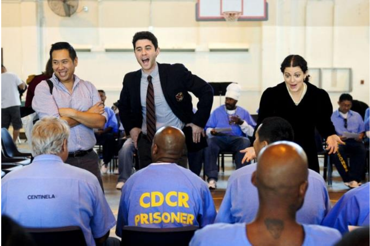
2014 Globe for All Tour at California State Prison, Centinela.