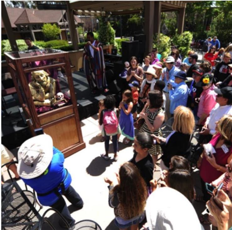
Happy Birthday, Mr. Shakespeare!, 2016.

We make theatre matter to more people by bringing artists and craftspeople together to create art through free cultural programs on the Globe plaza.