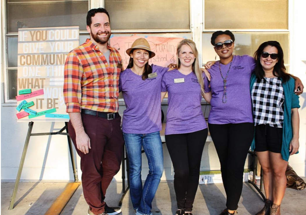
Arts Engagement staff at Castle Park Middle School for the 2016 Globe for All Tour.