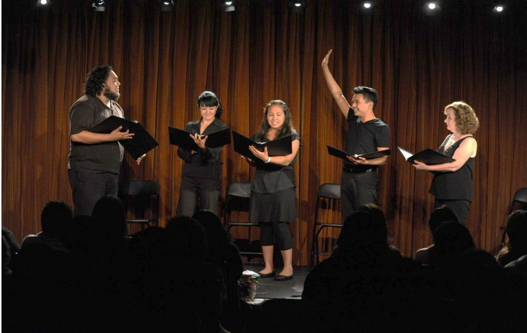
Community Voices presentation of plays by San Diego residents, 2012.