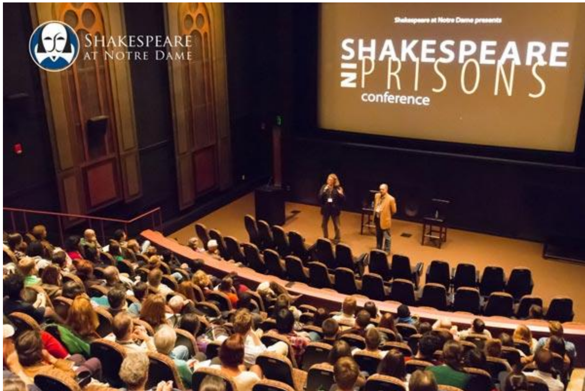
2016 Shakespeare in Prisons Conference. 2016.

In partnership with Shakespeare at Notre Dame and Shakespeare Behind Bars, The Old Globe will welcome approximately 150 theatre artists to the Shakespeare in Prisons Conference in March 2018. The biennial conference gives prison arts practitioners the opportunity to share their collective experiences, rejuvenate passion for their work, and build an expanded network of peers. Artists and educators, engaged in transformational arts programs using Shakespeare in prisons across the United States and the world, come together to share best practices and explore the effects such programming has on prison populations. The conference promotes a collaborative learning forum that exposes participants to a range of programs that all strive for a common result: the habilitation of the inmate's mind, heart, body, and spirit.