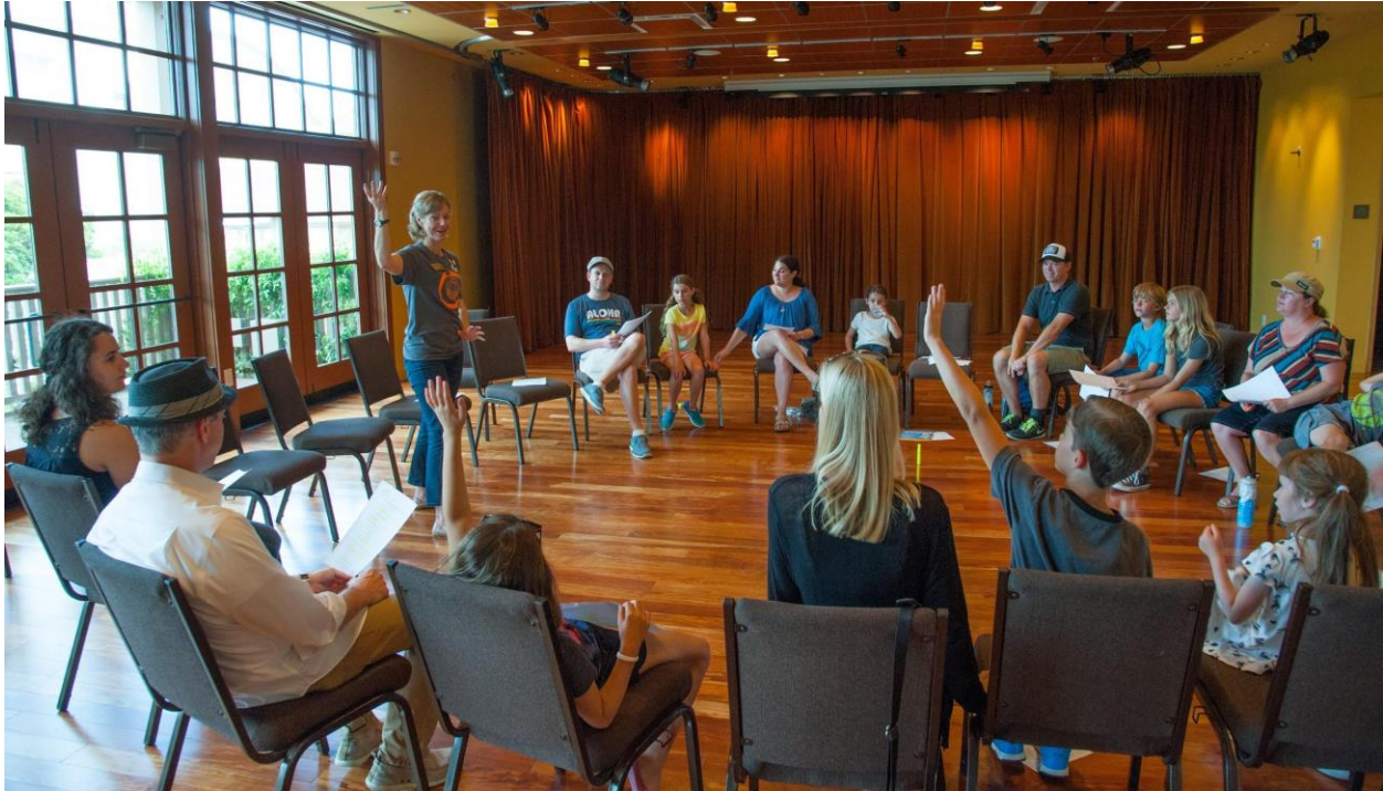
First Folio Family Workshop, 2016.