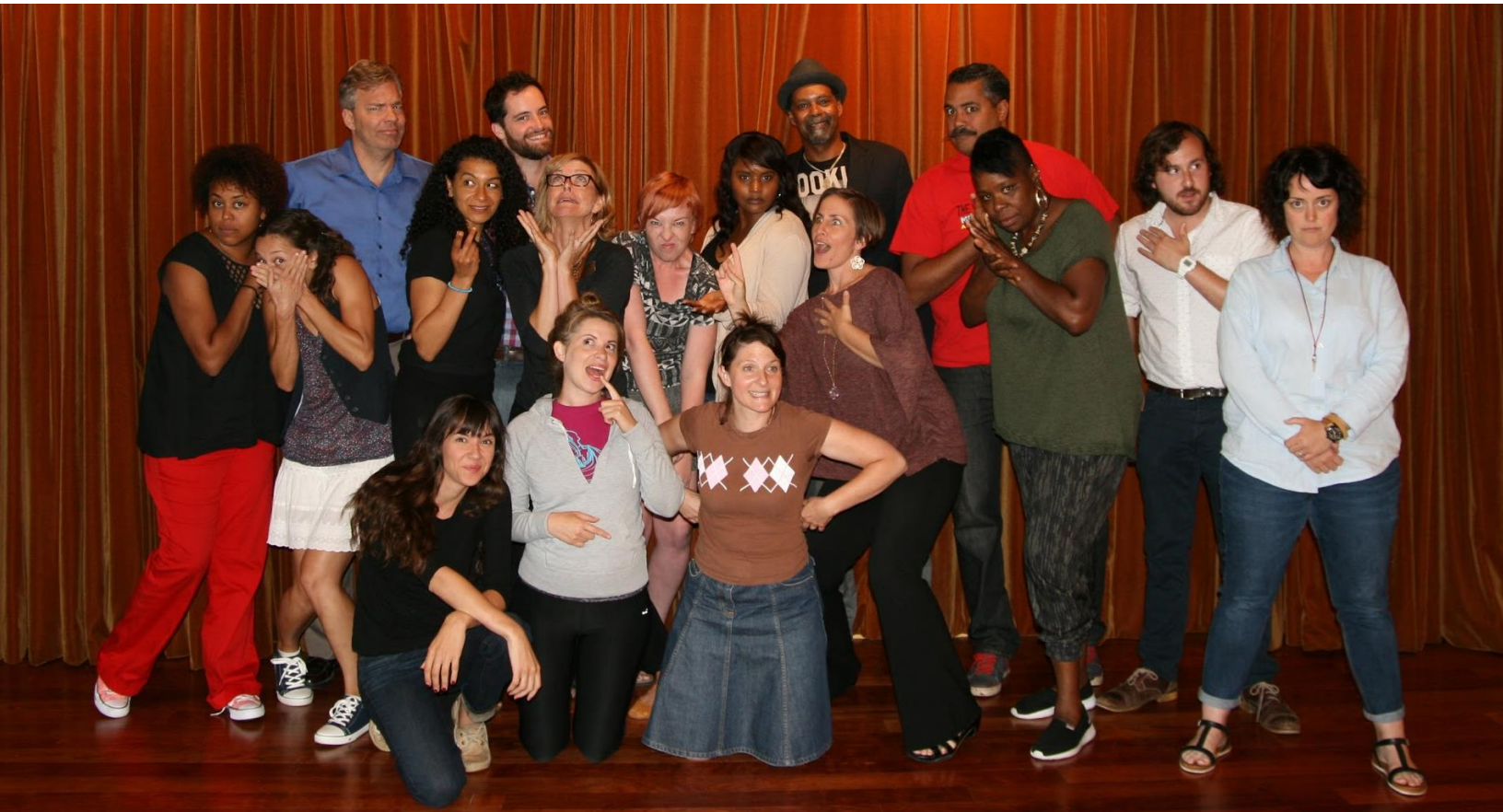
The Arts Engagement team of staff and teaching artists.