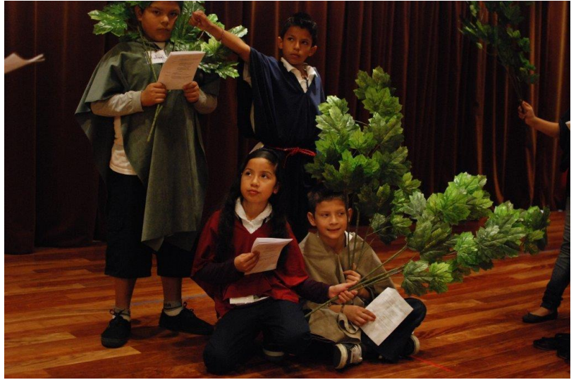
Rosa Parks Elementary School students performing A Midsummer Night's Dream .

The Old Globe is a proud participant of School in the Park, a multi-visit program funded by Price Charities that blends formal and informal learning by utilizing the rich resources of Balboa Park's renowned museums and educational institutions. The program is designed with a standards-based curriculum to integrate what is learned at school with new learning experiences at Park institutions. School in the Park significantly alters the traditional educational setting and methodologies of students and teachers by moving school into the larger community. This structured program focuses on high student expectations, alignment with state education standards, and authentic learning activities as students expand their education in an exciting, unique setting.