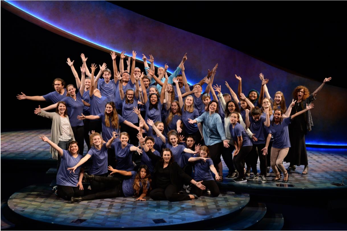
The 2016 Pam Farr Summer Shakespeare Studio class.