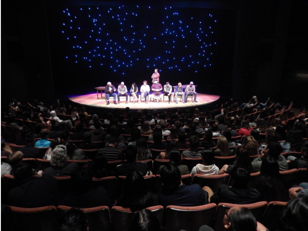
Student matinee post-show discussion with the cast of Picasso at the Lapin Agile .