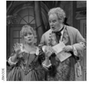
GLOBE GUILDERS Charter Sponsor since 1995