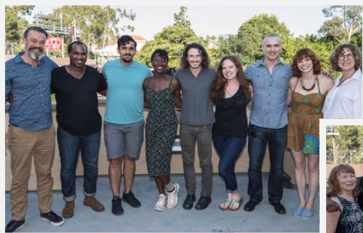
MFA cast and director for Julius Caesar . Opening night - October 20, 2018