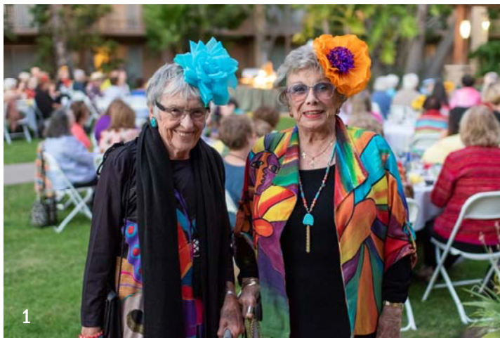
CAVORT attendees at optional extra on Thursday morning the 11th.